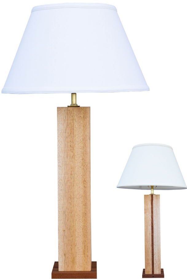
TABLE LAMP | TALL BOX CORD: 6' OVERALL HEIGHT: 33" BASE: 5-1/2" x 5-1/2"