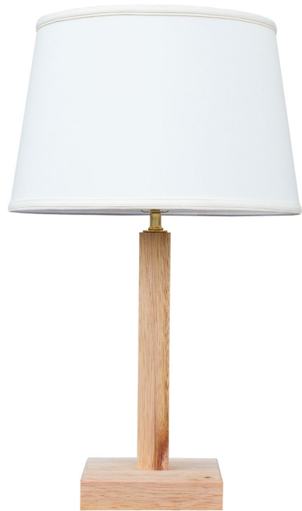
TABLE LAMP | SKINNY