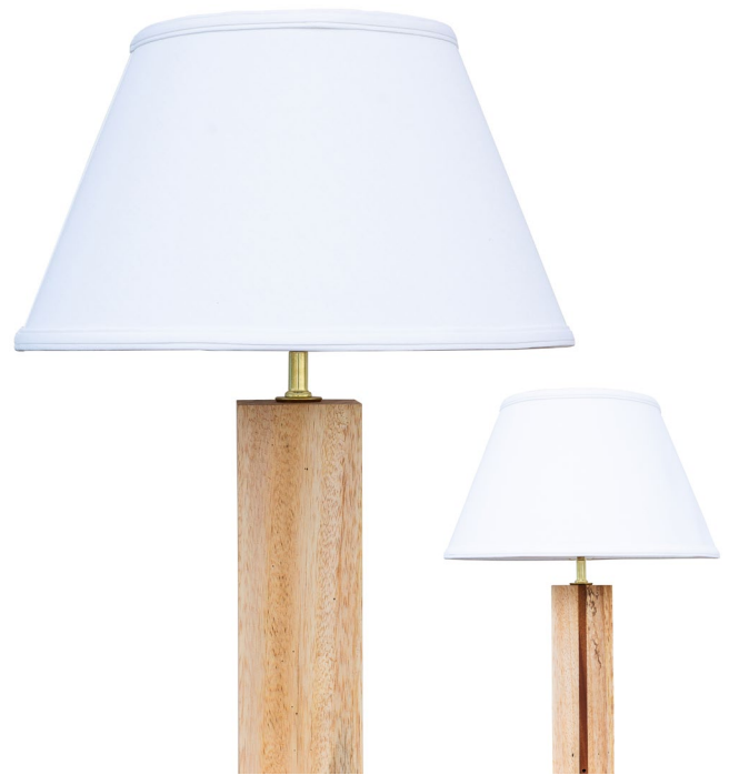
TABLE LAMP | SHORT BOX CORD: 6' OVERALL HEIGHT: 25" BASE: 4" x 4"